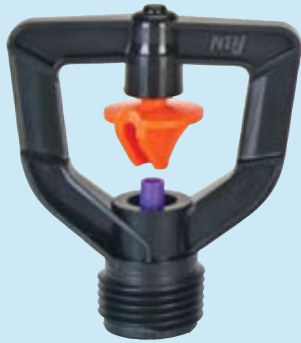
OPAL PERFORMANCE TABLE