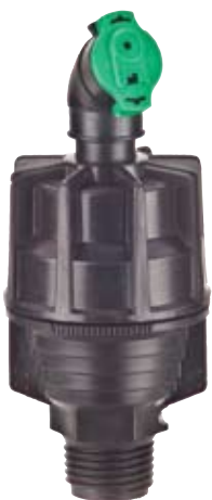
SUPER 10 PERFORMANCE TABLE